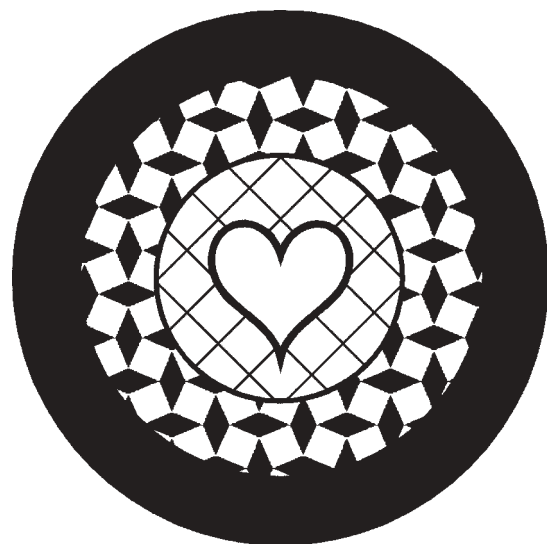
Target of Life

P ut yourself in the center of the heart of the Target of Life. Notice that the heart of the Target is clear, unobstructed, full of light. From there, you see clearly and make choices that are good for you and those around you. You are attuned to your inner guidance and best judgment. You feel at peace, strong, compassionate, joyful, energetic, and creative. Your reflexes are sharp, your immune system strong. You stumble and fall less often, and you handle life's inevitable challenges with more confidence and skill. Your ability to endure prolonged hardship increases. You are naturally more sensitive to others—more patient, generous, and understanding. You more easily express the richness of your authentic self. The more deeply centered you are in the heart of the Target of Life, the more love you feel and share. You are at your best—physically, mentally, and spiritually.